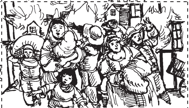
People escape from the fire.