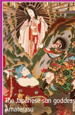
The Japanese sun goddess, Amaterasu