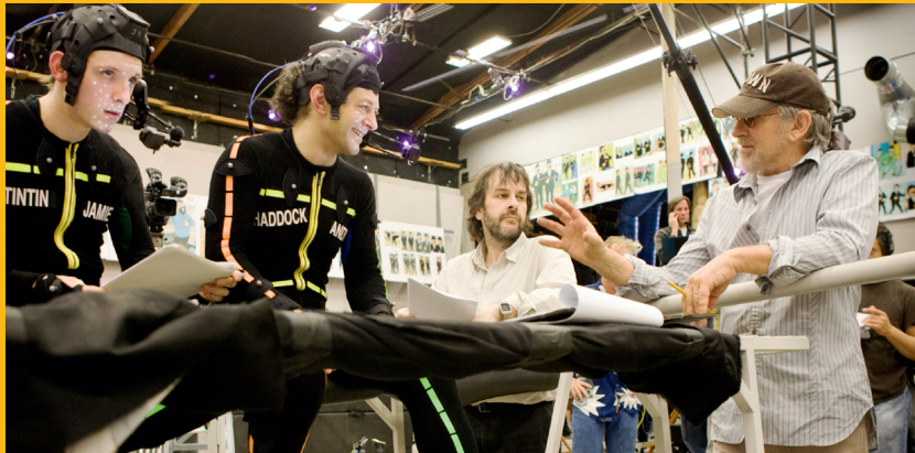
Jamie Bell and Andy Serkis wearing the special performance capture clothes.

artist create animate/animation character hero accent villain