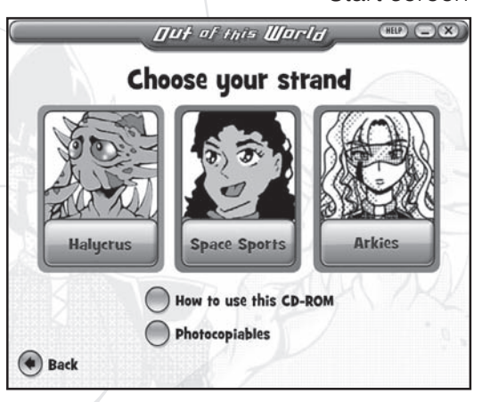
Main menu: click on a strand (for example, Halycrus).