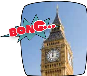
c) 'It's ..... !'