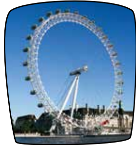
b) 'It's very ..... !'