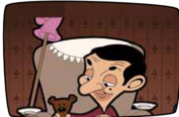
d) 'It's my ..... place!'