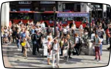
a) 'It's very busy !'