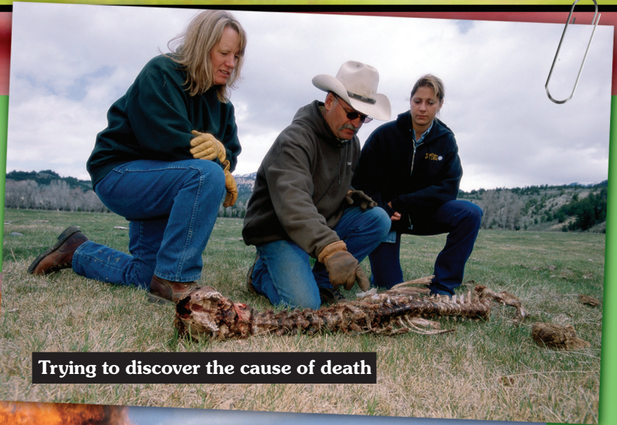
Trying to discover the cause of death