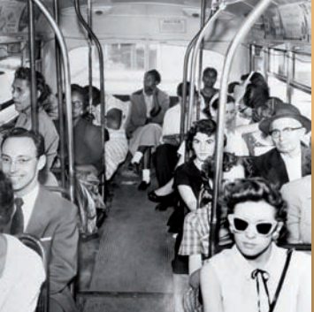
Black people had to ride at the back of buses.

In the early 1960s, nearly one hundred years after the end of slavery, black people still did not have the same rights as white people. In 1954 the high court in the USA said that racial segregation